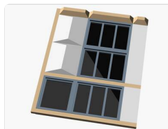
03-Wall (Qty 4)