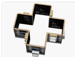
01-Perimeter (Qty 1)