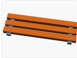
05-Railing (Qty 8)