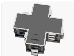
00-Assembly (Qty 1)

Included are optimized 3MF files for the complete assembly and all individual components. Files preserve object structure and color surface regions where applicable. Some components require multiple printed copies; the required quantity is indicated in each caption. Below is an illustrated overview of the included digital components: