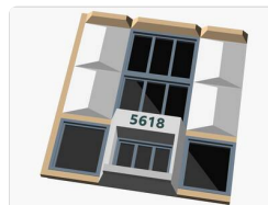
04-Wall (Qty 4)