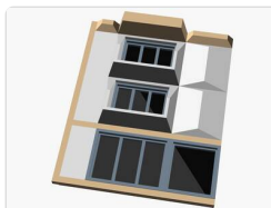
02-Wall (Qty 4)