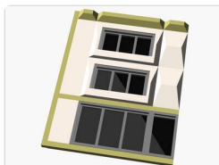
02-Wall (Qty 4)