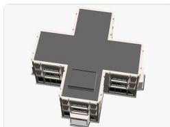
00-Assembly (Qty 1)

Included are optimized 3MF files for the complete assembly and all individual components. Files preserve object structure and color surface regions where applicable. Some components require multiple printed copies; the required quantity is indicated in each caption. Below is an illustrated overview of the included digital components: