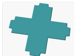
06-Base (Qty 1)

This kit is available at 3dKitFactory.com/kit/AM-GAZSWY .