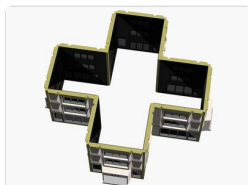
01-Perimeter (Qty 1)