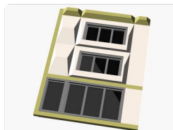
03-Wall (Qty 4)