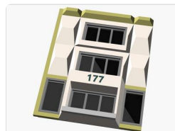
04-Wall (Qty 4)