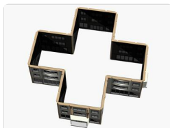
01-Perimeter (Qty 1)