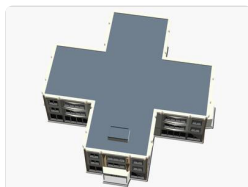
00-Assembly (Qty 1)

Included are optimized 3MF files for the complete assembly and all individual components. Files preserve object structure and color surface regions where applicable. Some components require multiple printed copies; the required quantity is indicated in each caption. Below is an illustrated overview of the included digital components: