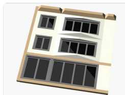
03-Wall (Qty 4)