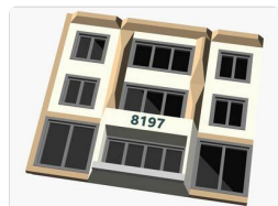
04-Wall (Qty 4)