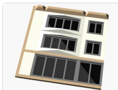
02-Wall (Qty 4)