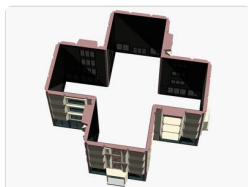
01-Perimeter (Qty 1)