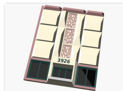
04-Wall (Qty 4)