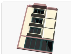
02-Wall (Qty 4)