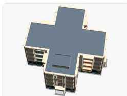
00-Assembly (Qty 1)

Included are optimized 3MF files for the complete assembly and all individual components. Files preserve object structure and color surface regions where applicable. Some components require multiple printed copies; the required quantity is indicated in each caption. Below is an illustrated overview of the included digital components: