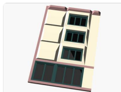
03-Wall (Qty 4)