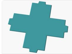
07-Base (Qty 1)

This kit is available at 3dKitFactory.com/kit/AM-17YSWY .