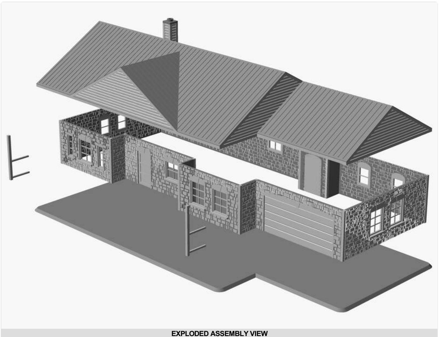
EXPLODED ASSEMBLY VIEW