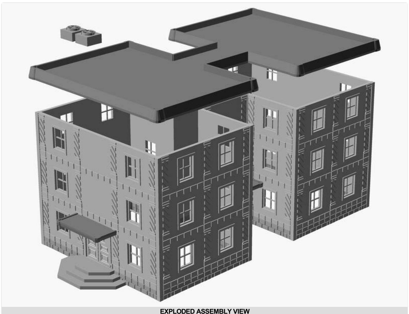
EXPLODED ASSEMBLY VIEW