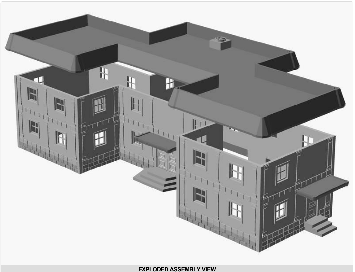
EXPLODED ASSEMBLY VIEW