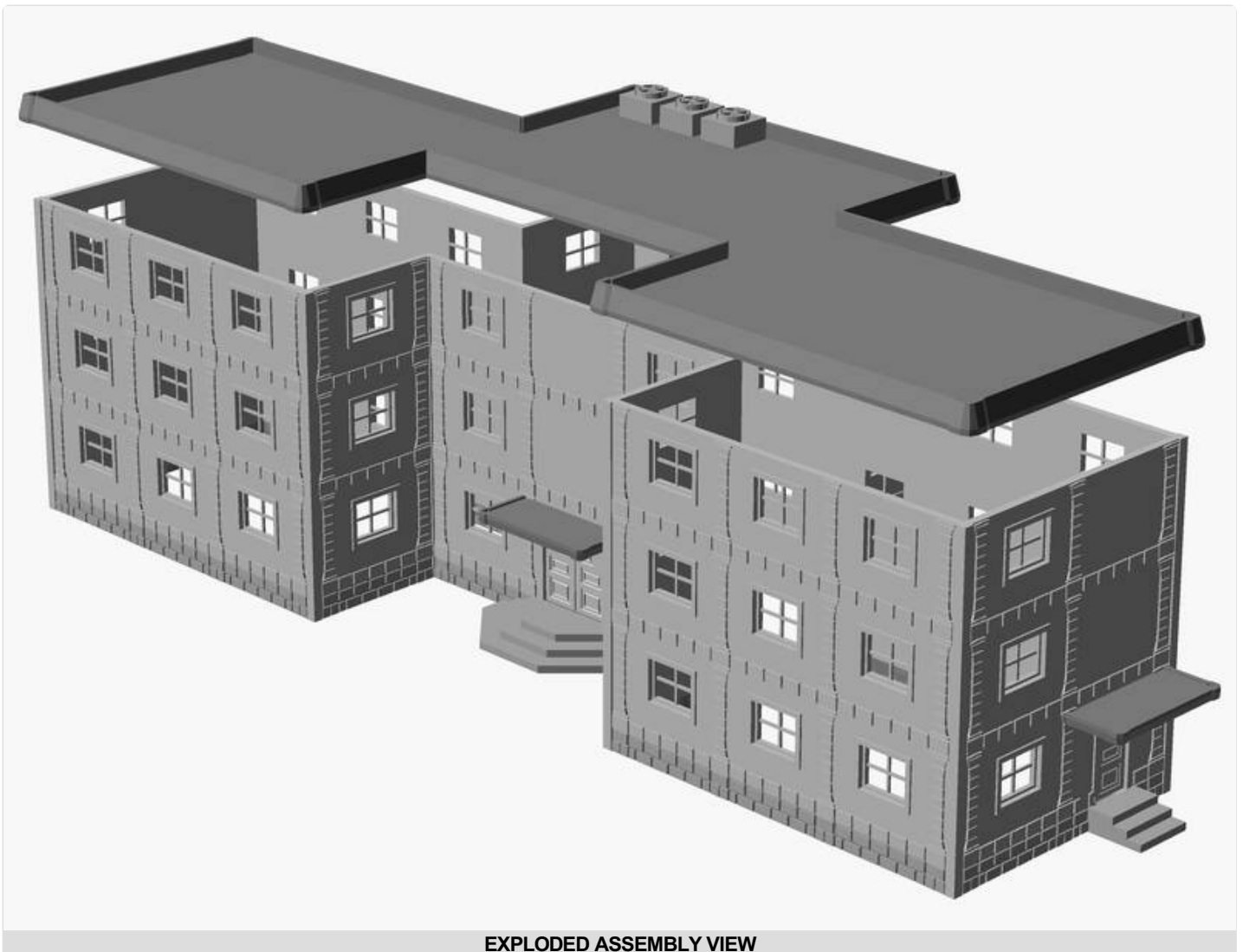
EXPLODED ASSEMBLY VIEW