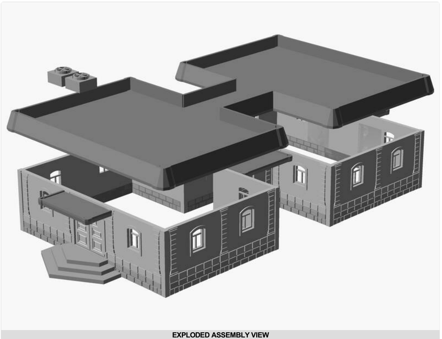
EXPLODED ASSEMBLY VIEW