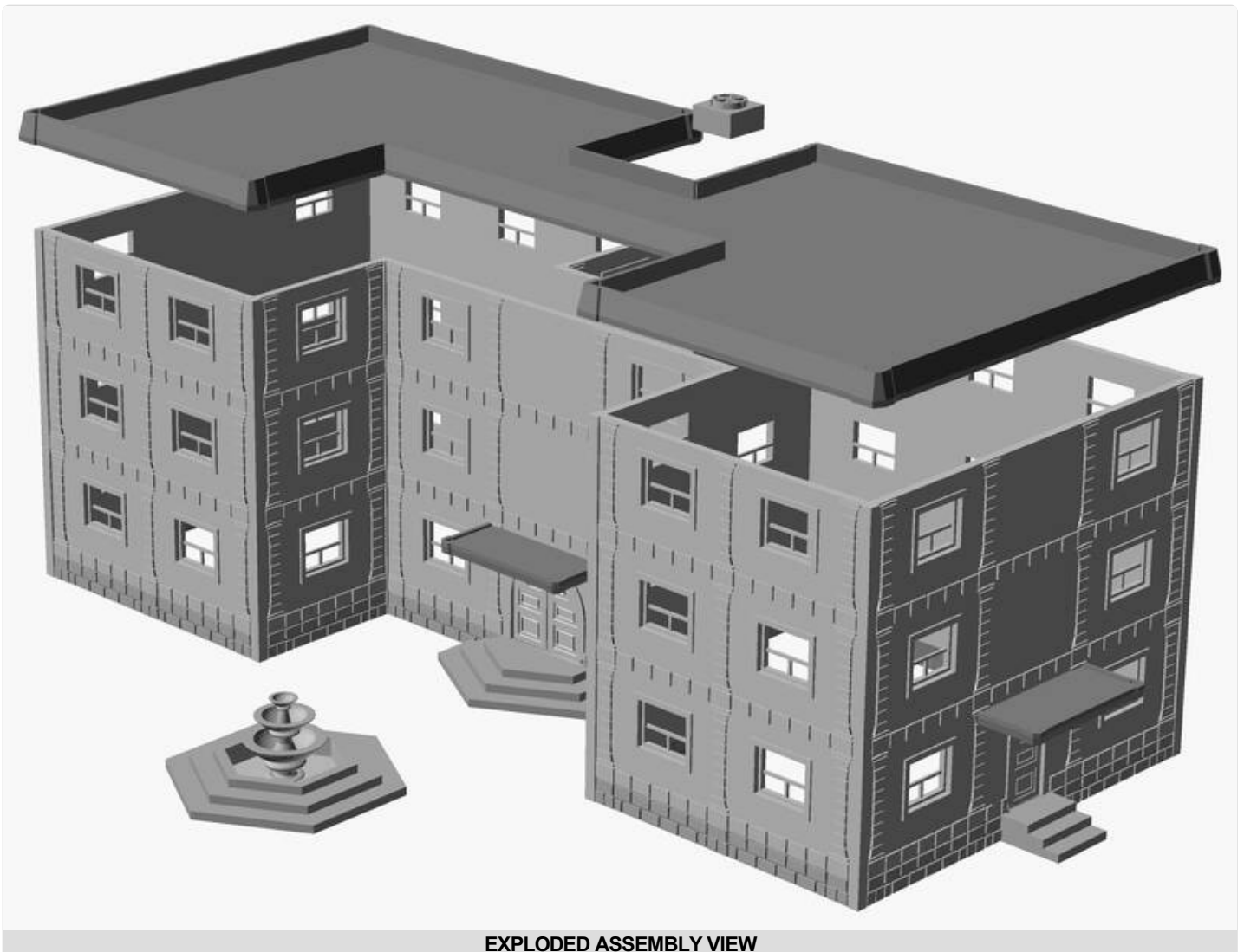
EXPLODED ASSEMBLY VIEW