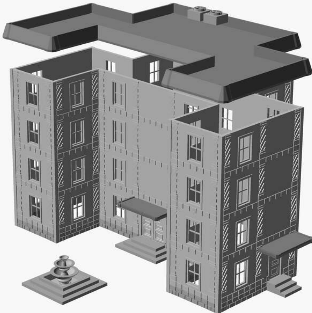
EXPLODED ASSEMBLY VIEW