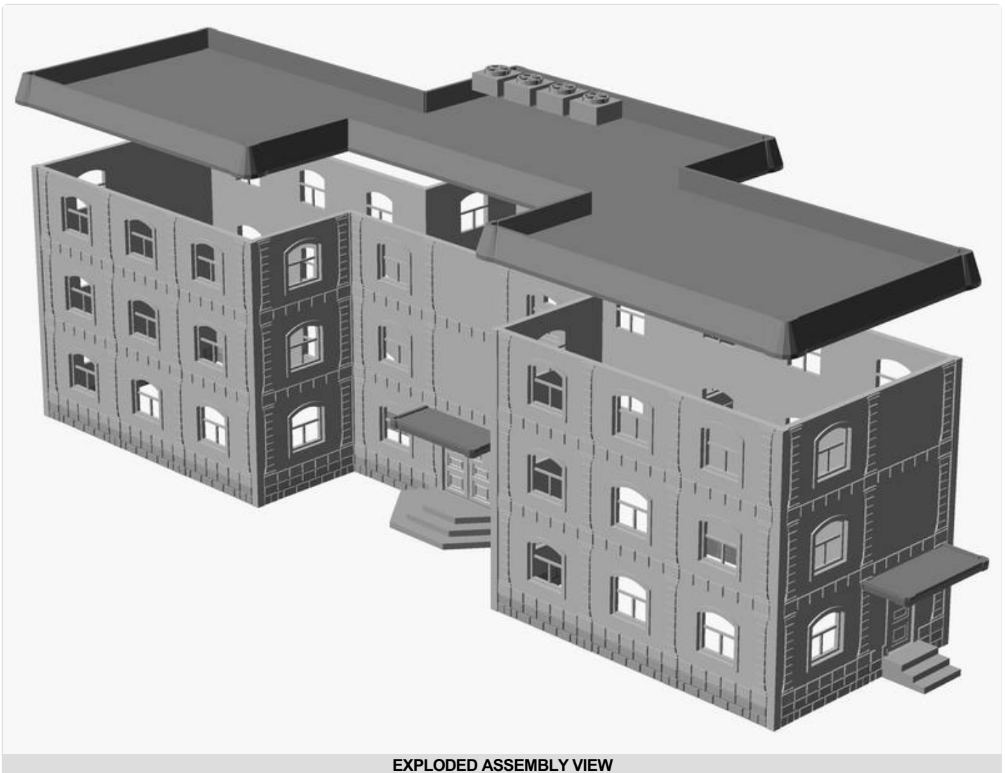
EXPLODED ASSEMBLY VIEW