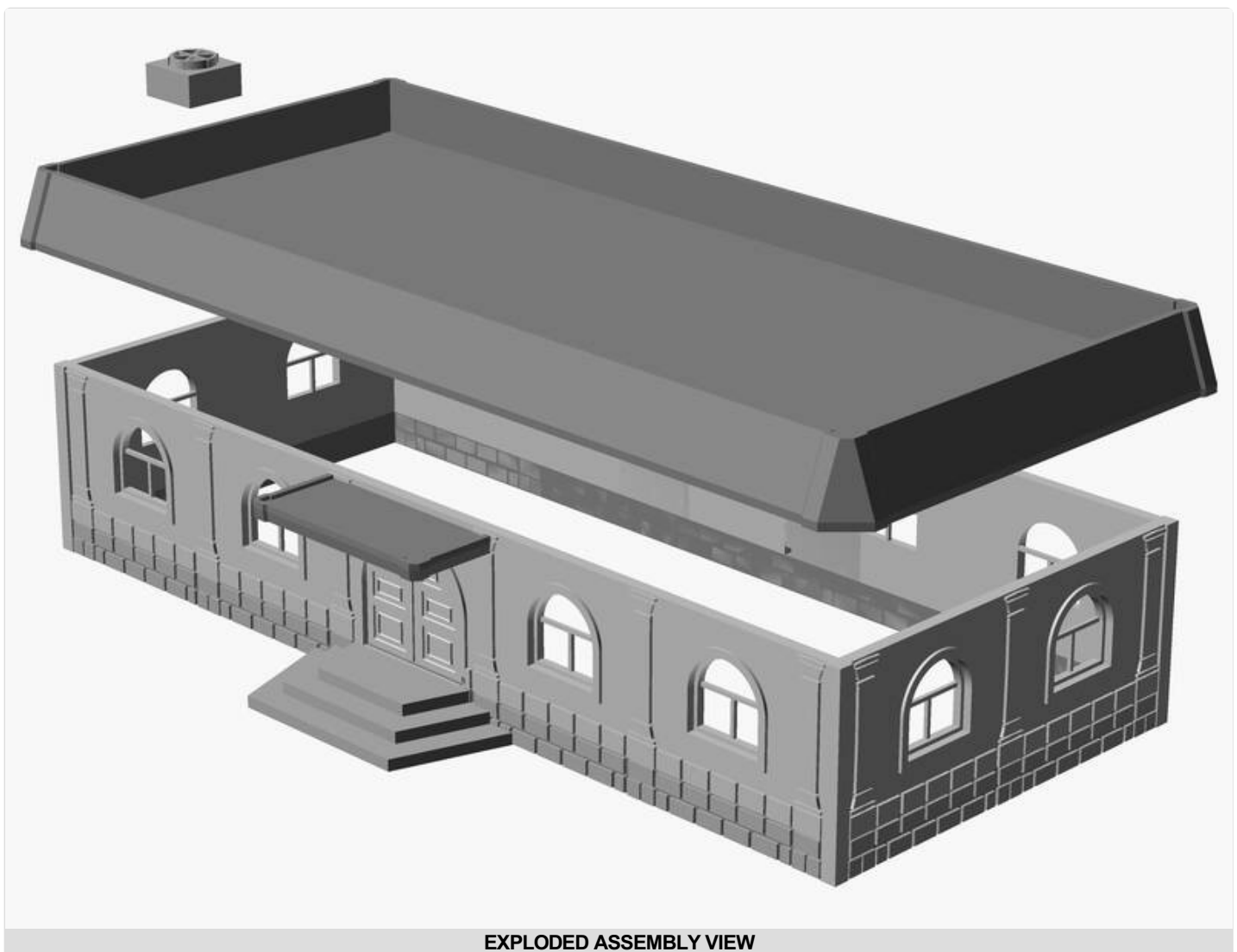
EXPLODED ASSEMBLY VIEW