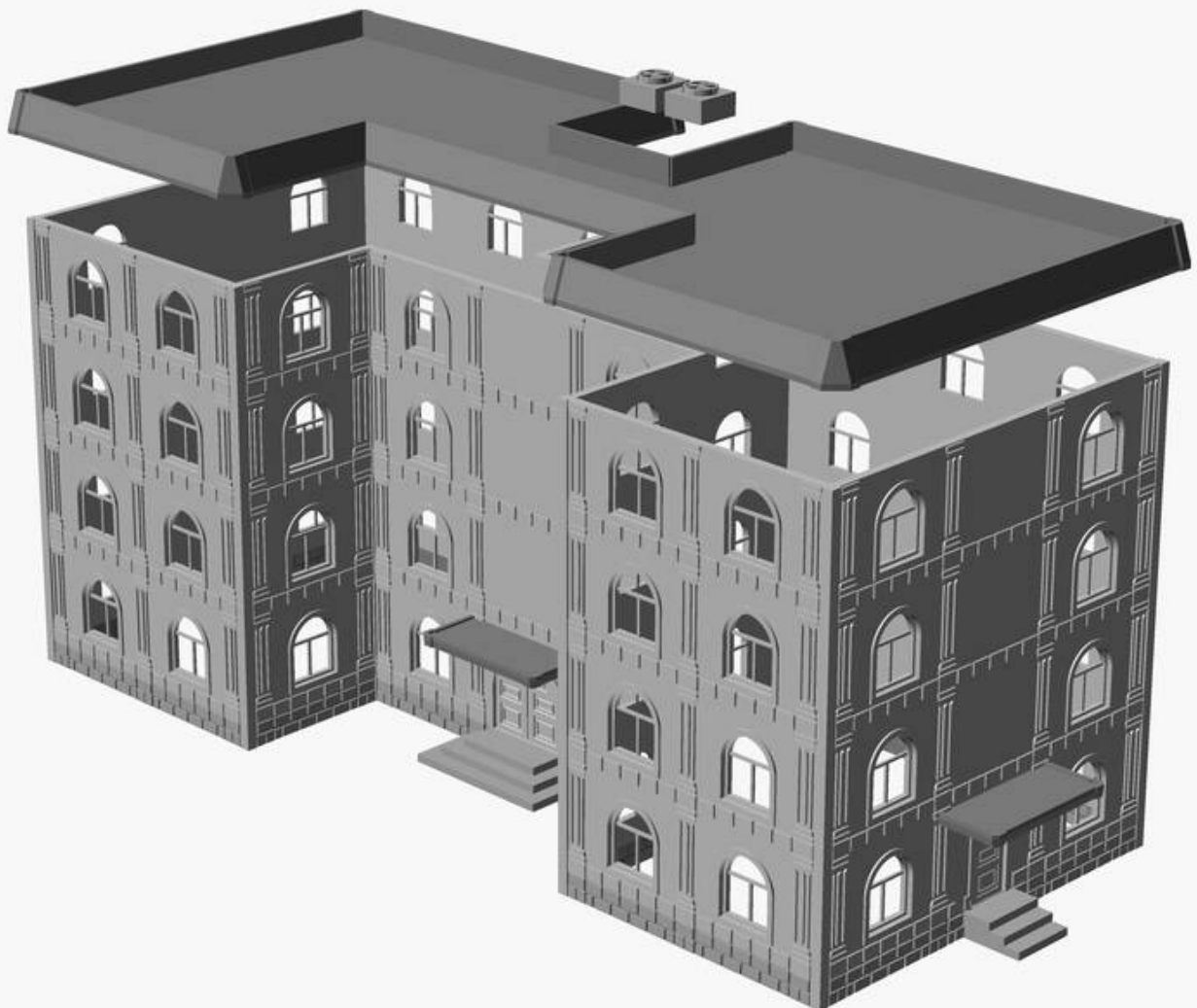
EXPLODED ASSEMBLY VIEW