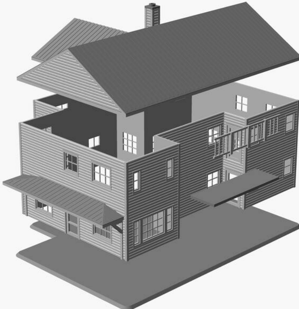
EXPLODED ASSEMBLY VIEW