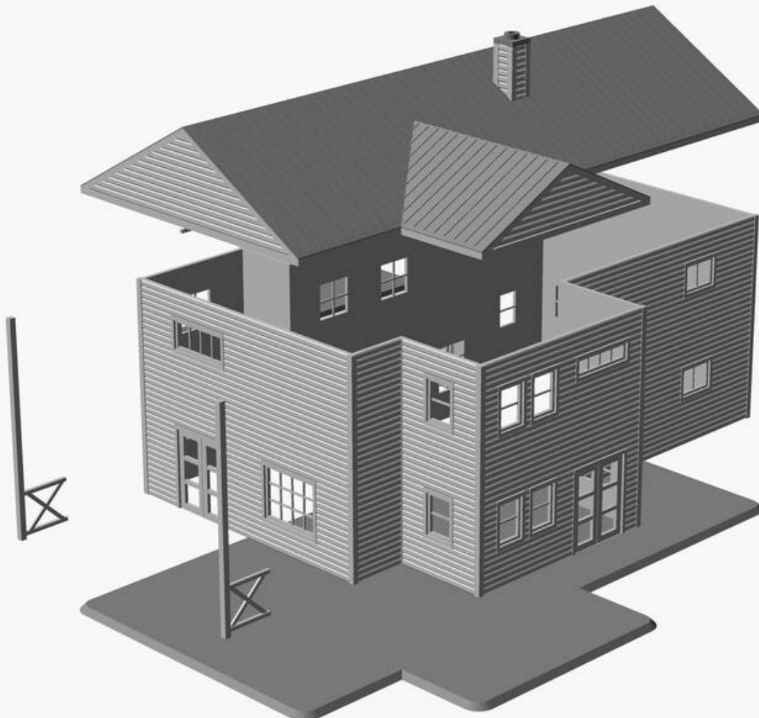
EXPLODED ASSEMBLY VIEW