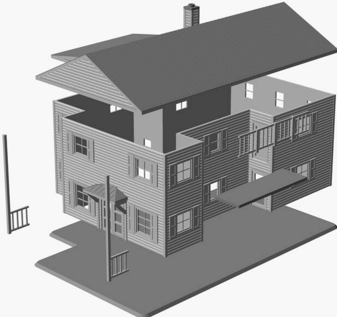
EXPLODED ASSEMBLY VIEW