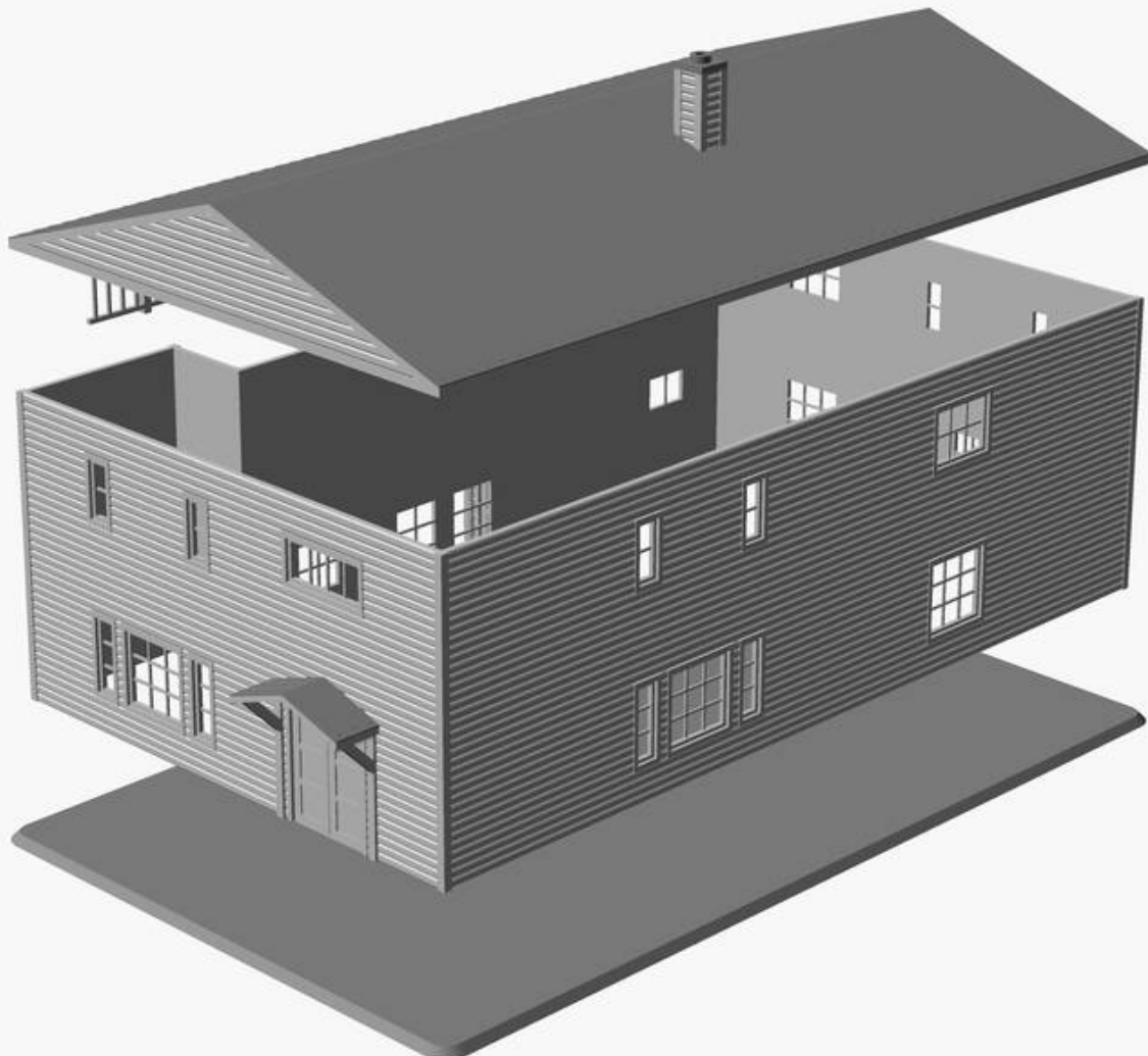
EXPLODED ASSEMBLY VIEW