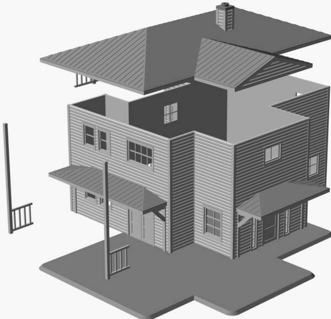
EXPLODED ASSEMBLY VIEW