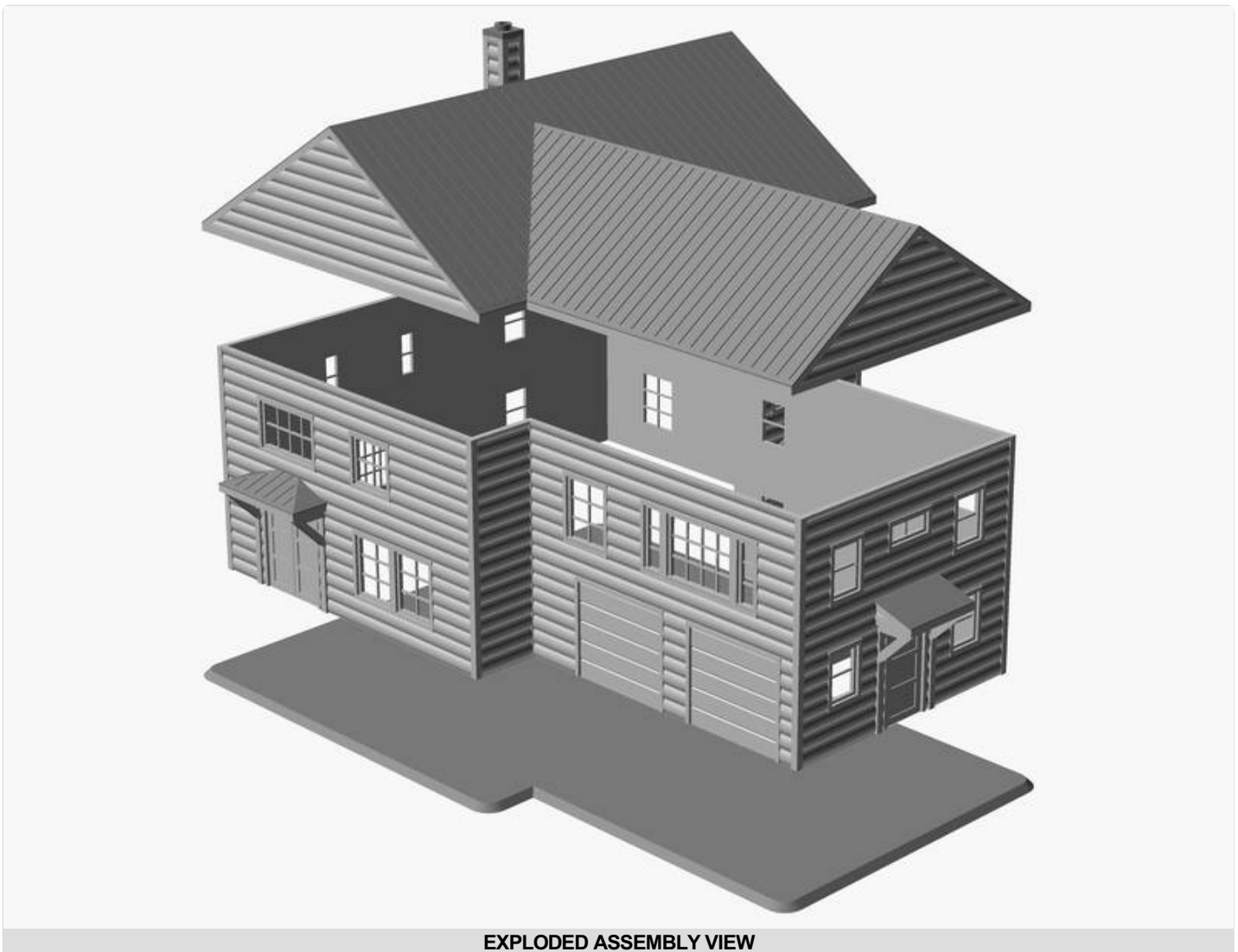
EXPLODED ASSEMBLY VIEW