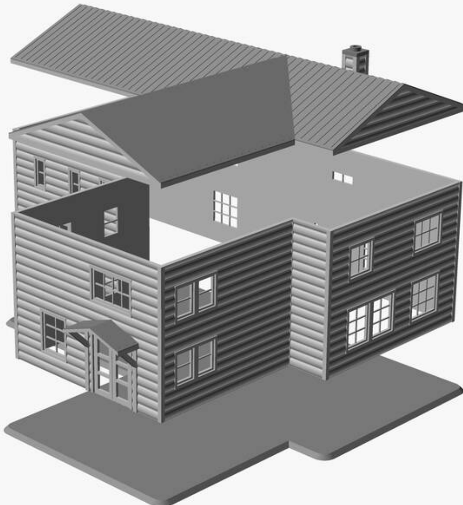
EXPLODED ASSEMBLY VIEW