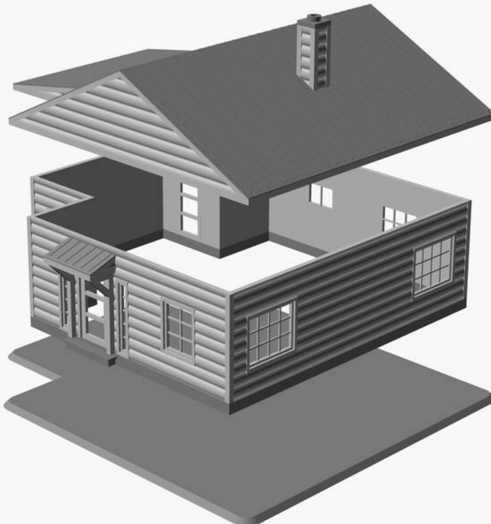
EXPLODED ASSEMBLY VIEW