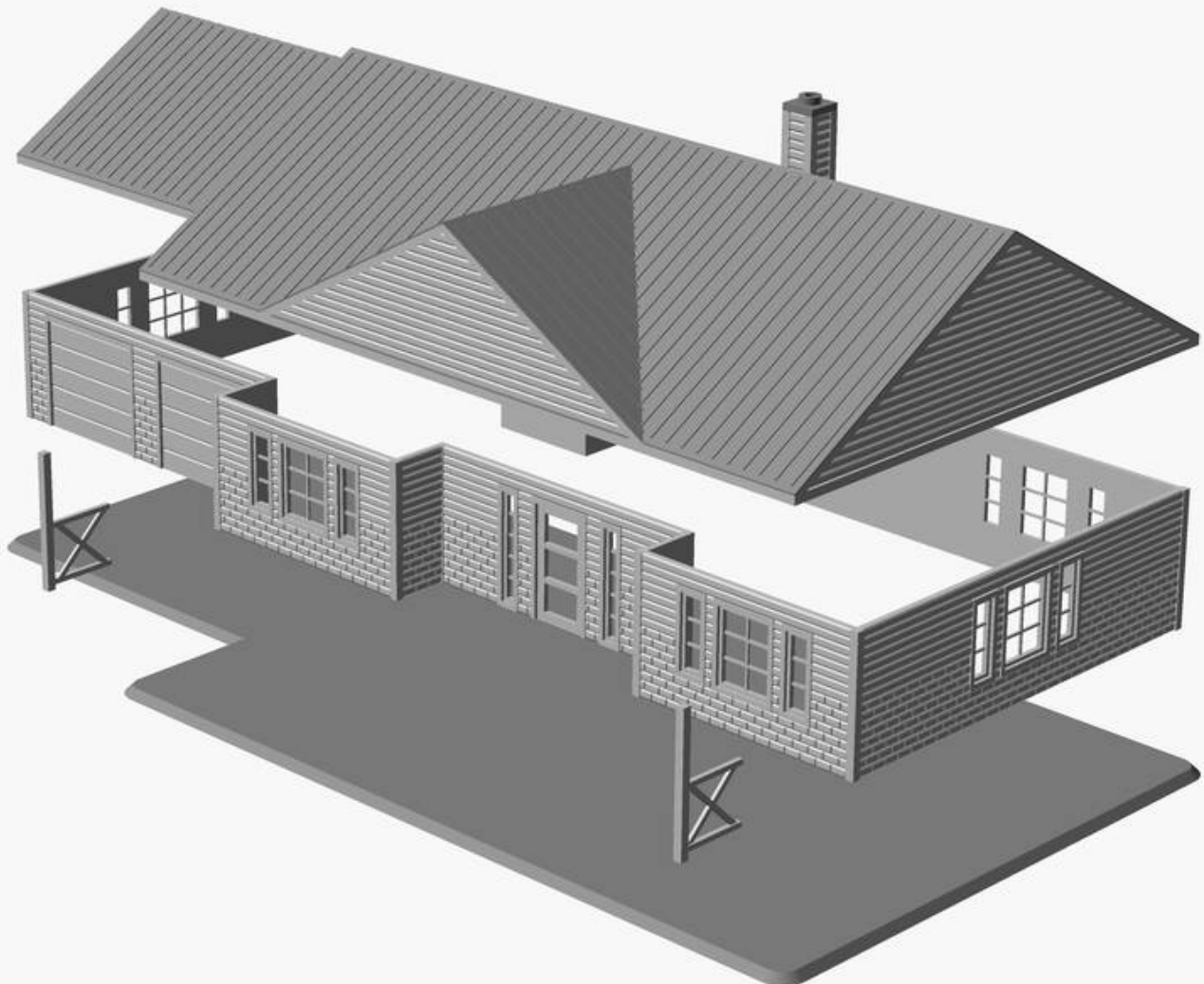
EXPLODED ASSEMBLY VIEW